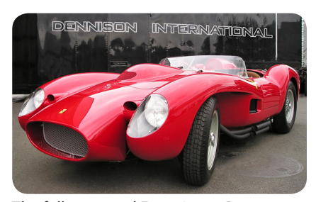
The fully restored Ferrari won Bestof-Class in 2006 and sold for a recordbreaking $16.4 million in 2011 at the Pebble Beach Concours d'Elegance in Carmel, California.