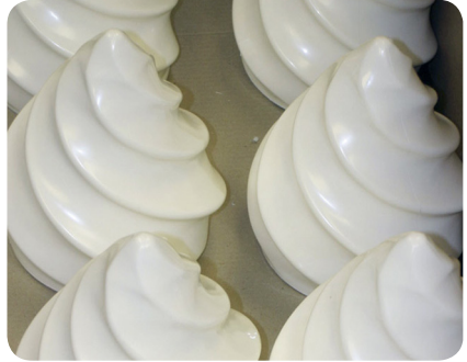
Cobalt's 3D surface modelling (middle) enabled six swirl designs to be prototyped using STL (above) for evaluation.