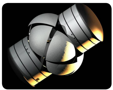
Concept renderings done in Cobalt of the Payload Transportation Module (PTM) for safely carrying research and commercial experiments into space and lunar orbit.