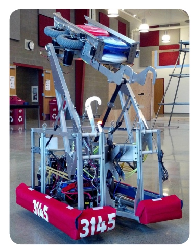
RoDel, the TeraViks' winning robot.