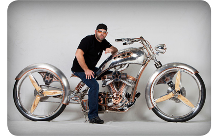
Paul Teutul, Jr. on the winning bike in the American Chopper Build-off .

"I have to give your program credit. It's so easy to use and so quick. For designing suspension stuff like what I'm doing, it's like being able to sketch. It's just really, really good for doing that because I can do stuff so quickly and make changes. So it really helped when we were making it."